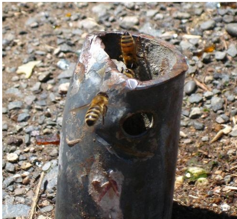
Bees entering their pipe

One interesting thing I saw was a wild colony living underground. We read and are told that bees like to be up high, but I saw a colony living in some cavity underground at the edge of a carpark, accessing it through a broken steel pipe set in the ground.