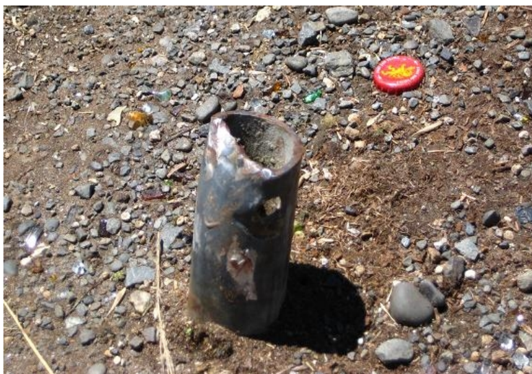
The pipe in context