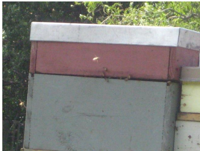
A top entrance

One interesting thing I saw was a wild colony living underground. We read and are told that bees like to be up high, but I saw a colony living in some cavity underground at the edge of a carpark, accessing it through a broken steel pipe set in the ground.